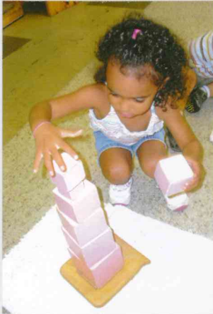
Toddler Geometric Exploration